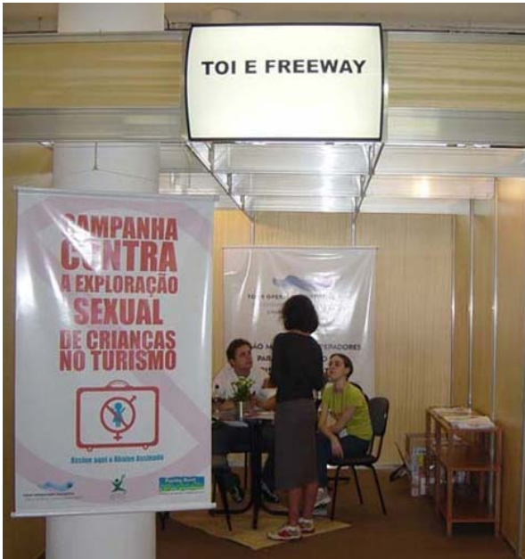
Foto: the TOI and Freeway stand at the Adventure Sports Fair 2004

Freeway has been awarded the American Chamber of Commerce Eco Prize in Brazil , in the category Supply Chain , with our Campaign against Sexual Exploitation in Tourism .