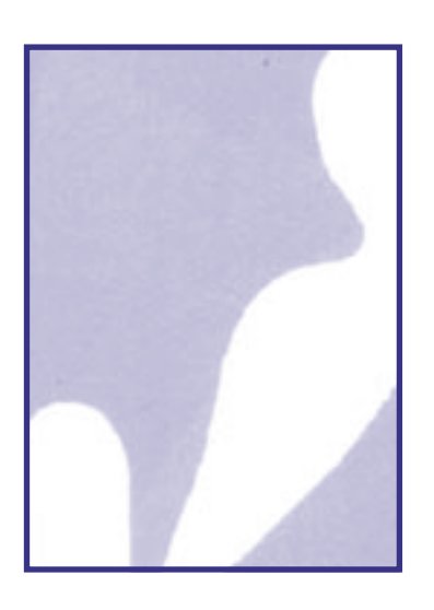
Child Sexual Abuse and Commercial Sexual Exploitation of Children in the Pacific: